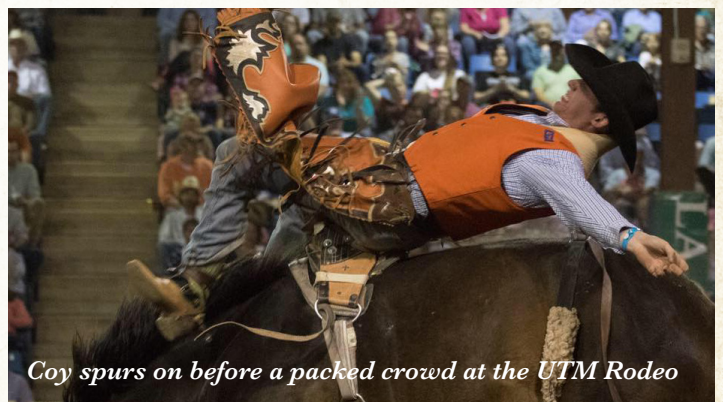
Coy spurs on before a packed crowd at the UTM Rodeo